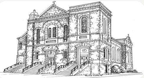
ST. PATRICK 64 Pearl Street